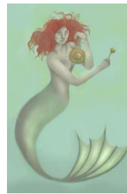
37. Gong Gong