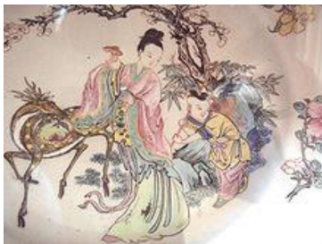
18. Xi Wangmu