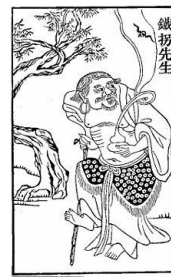
11. Iron Crutch Li