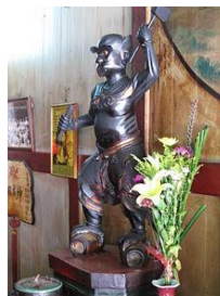
20. Lei Gong