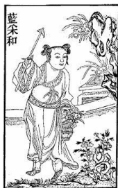
12. Lan Caihe