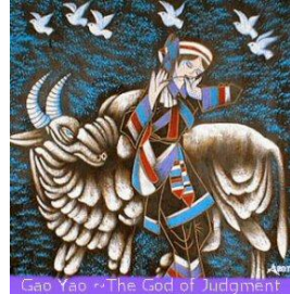
45. Gao Yao