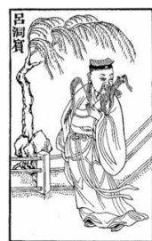
13. Lu Dongbin