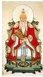
7. Daode Tianzun