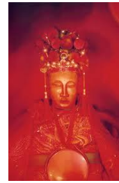
33. Tam Kung