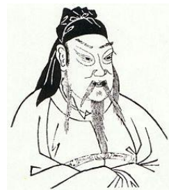
22. Guan Yu