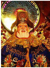
29. Tu Di Gong