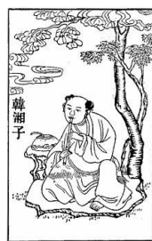
14. Han Xiang Zi