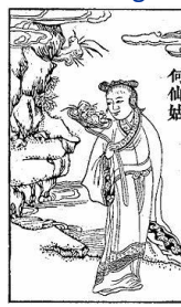
9. Nesmrtna ženska He Xiangu