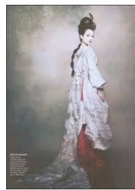
35. Meng Po