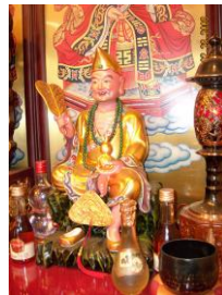
46. Tu Er Shen