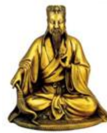
34. Wong Tai Sin