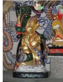
24. Kui Xing