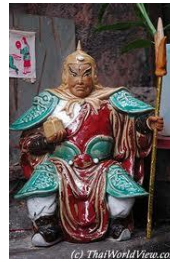
32. Hung Shing