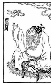
10. Cao Guojiu