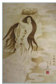
36. Zhu Rong