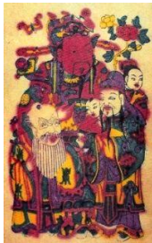
23. Cai Shen